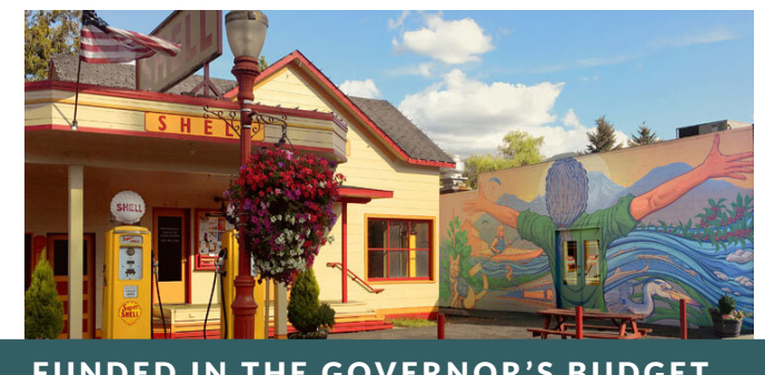
FUNDED IN THE GOVERNOR'S BUDGET

Creative Districts encourage economic development and job creation in the creative sector, which generates over 10% of Washington State's GDP. ArtsWA anticipates several new Creative Districts to be certified within the next 2-3 years. ArtsWA requests continued funding to support small-scale capital projects for existing, new, and forthcoming Creative Districts.