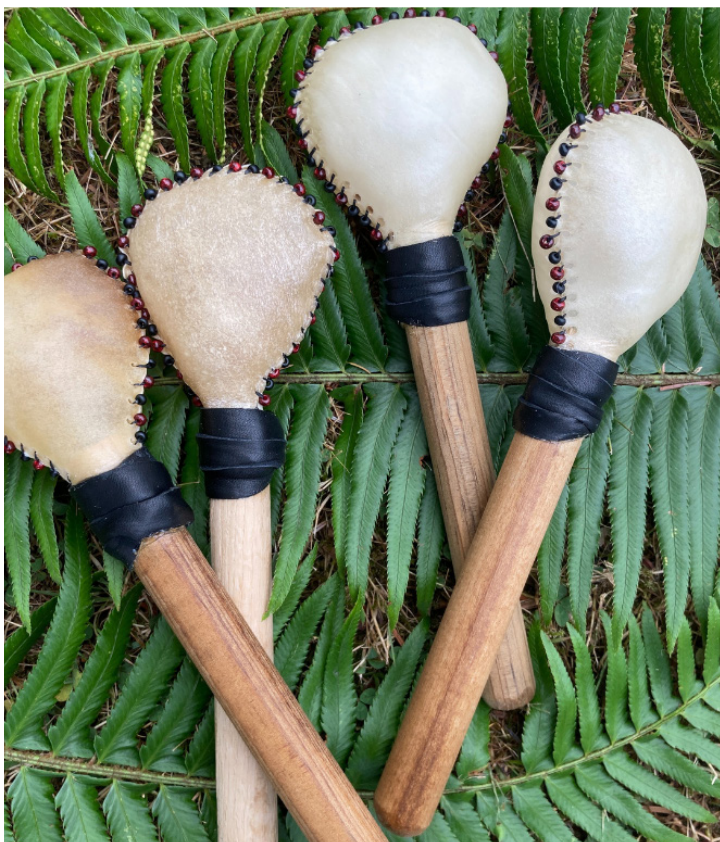
Snipe Dance Rattles, Makah Tribe