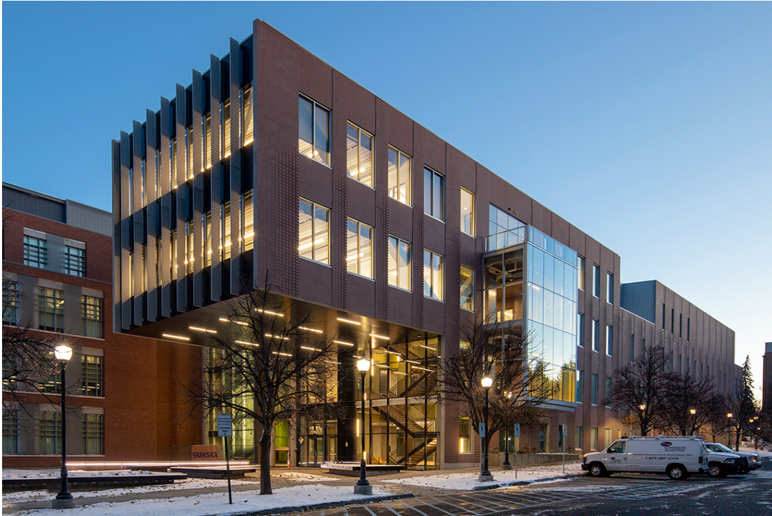
LMN Architects

Washington State University (WSU) and Washington State Arts Commission (ArtsWA)